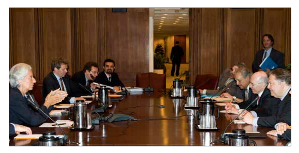
IMF director Christine Lagarde meets with Greek Finance Minister Evangelos Venizelos on July 25, 2011.