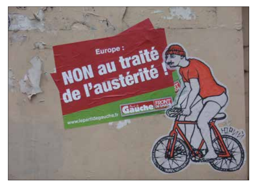
Left Party France poster. The caption reads: "Europe: Say no to austerity deal"

and to pay off the debts of three banks—Anglo Irish Bank, Allied Irish Bank, and Bank of Ireland.<sup>252</sup>