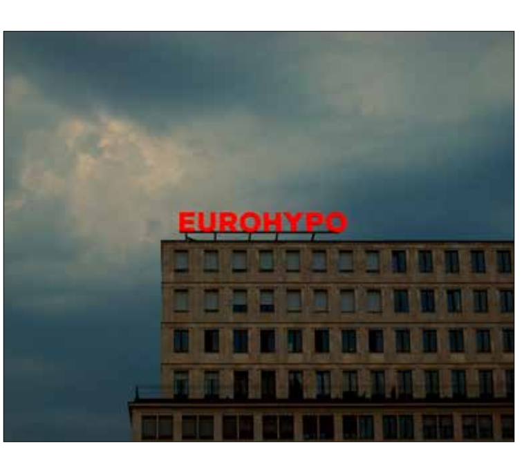
Eurohypo offices in Berlin.

Eurohypo was created in late 2001 when Commerzbank, Dresdner Bank, and Deutsche Bank—three of Germany's biggest private banks—merged their real estate portfolios. The move was meant to salvage ventures