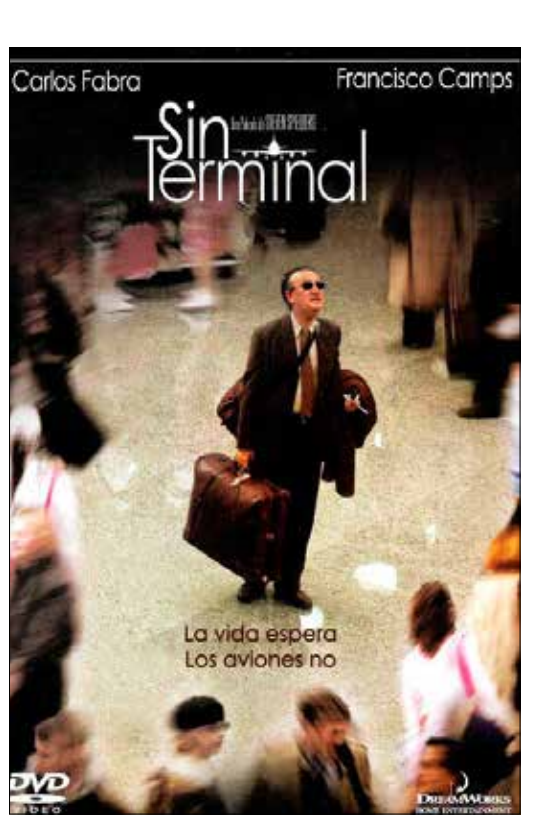
Parody of The Terminal poster. The caption reads: "Life is Expected, Just No Planes."

Some 75 kilometers south, a five-star, luxurious Hilton hotel offers panoramic views of Valencia, Spain's third largest city. The €110-million project—financed by Eurohypo—opened in 2008, and declared bankruptcy a year later. <sup>167</sup>