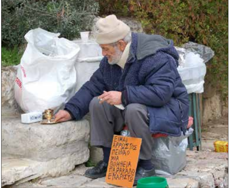
Beggar outside Agios Dimitrios. His sign reads: "I am sick, and hungry. Please help me. Thank you."

Then came potentially deal-killing problems: First, construction on the land was not permitted; and