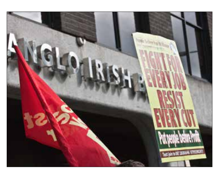
European Day Of Action protest march outside Anglo Irish Bank in September 2010.

The scheme drew a tight concentration of major European banks. If you stand in front of the Jeanie Johnston, a replica of a boat that took 19<sup>th</sup> century Irish emigrants to the Americas, you can look straight down