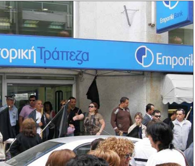
Protest outside Emporiki bank in Komotini, Greece, in 2009.

In June 2006, Pauget pounced on Emporiki Bank of Greece, offering €3.1 billion in cash to take it over. 124 A little more than two vears after Bouton had bought Geniki, Pauget's move was still considered a bold move given that Emporiki was the least profitable of Greek banks at the time. But Emporiki appeared to have po-