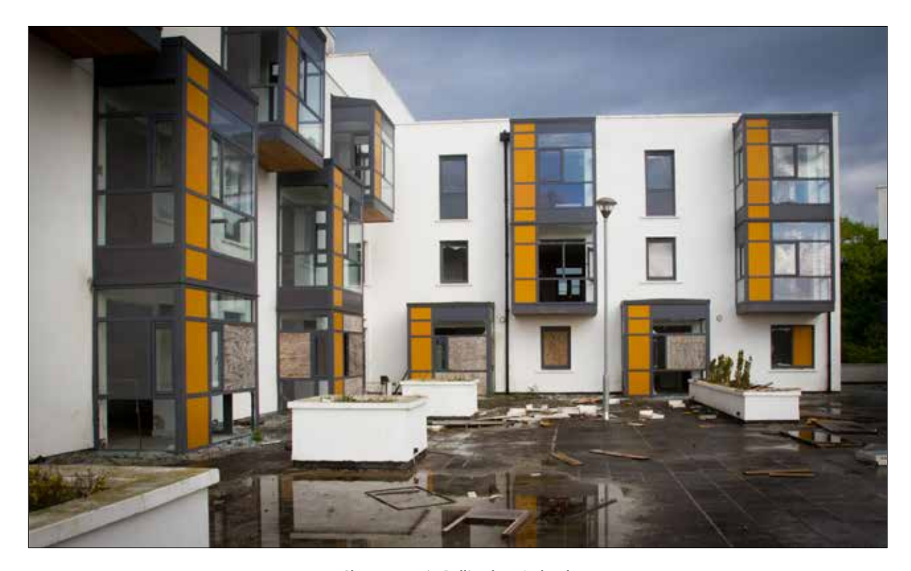
Ghost estate in Ballisodare, Ireland

Both WestLB and Sachsen had tens of billions financed through a range of risky financial vehicles that they set up in Ireland, which issued complex instruments like asset-based commercial paper (ABCP.)<sup>219</sup>