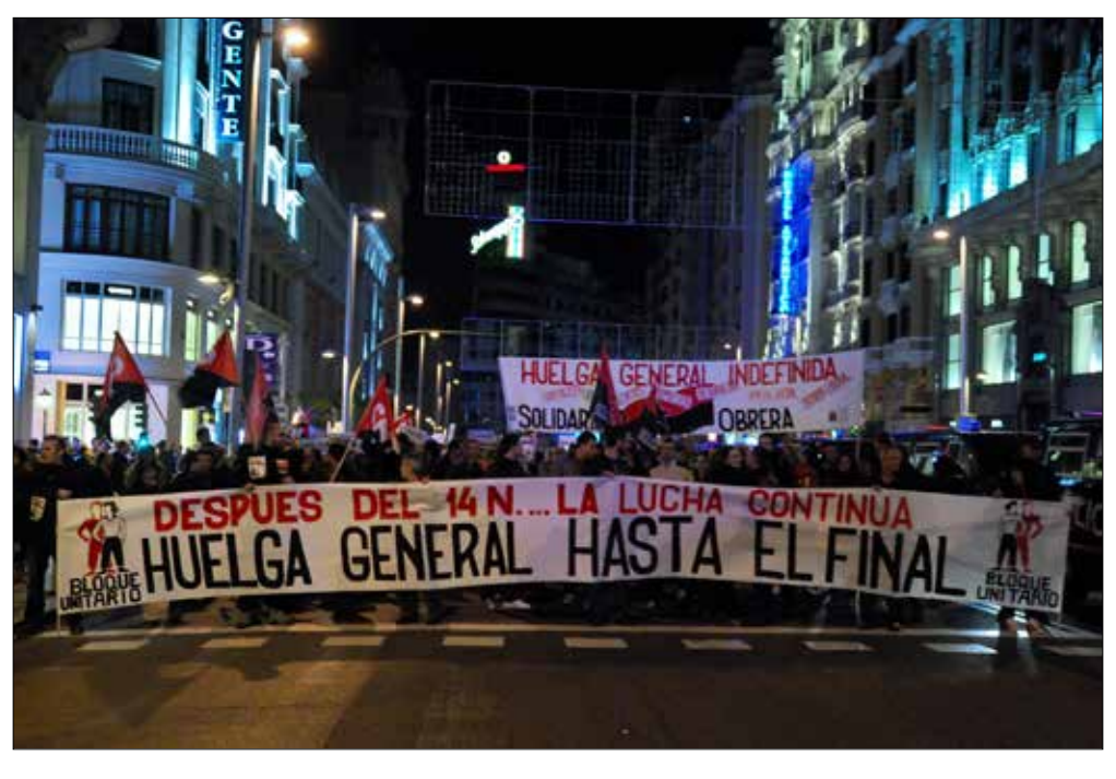
November 15 rally against austerity in Madrid.

he three countries we have described—Greece, Ireland, and Spain—now face years of crippling debt to pay for the last decade's lending spree by Belgian, French, and German banks.