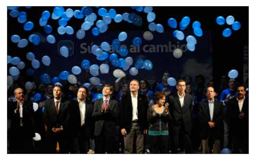
Partido Popular campaign event in Castellón, November 2011.

in Partido Popular, which ran Spain from 1996 to 2004. 172