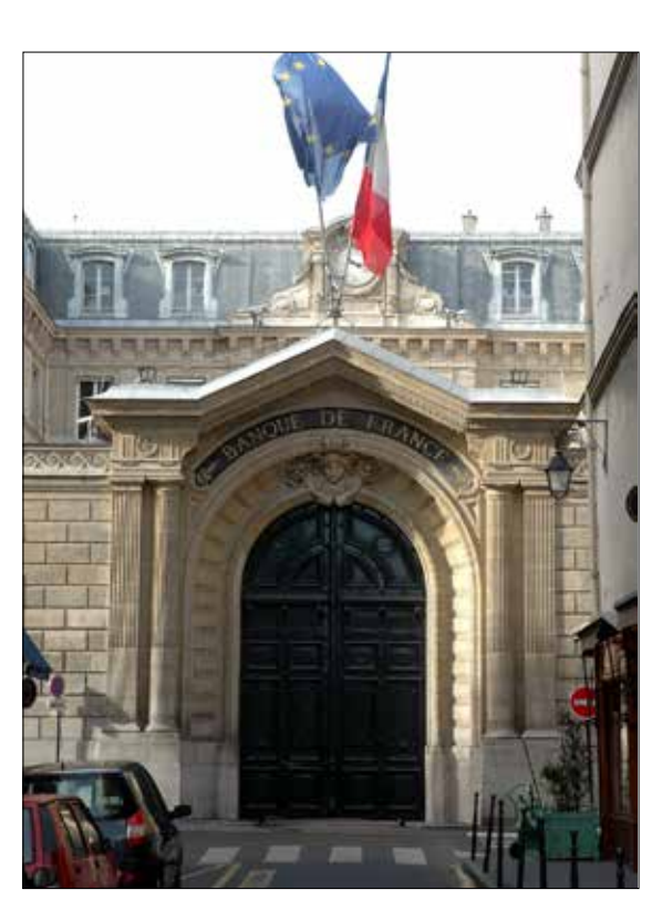
Banque de France offices in Paris.

banks. He later explained that he believed the industry needed to "shoulder its responsibilities to the business community."96