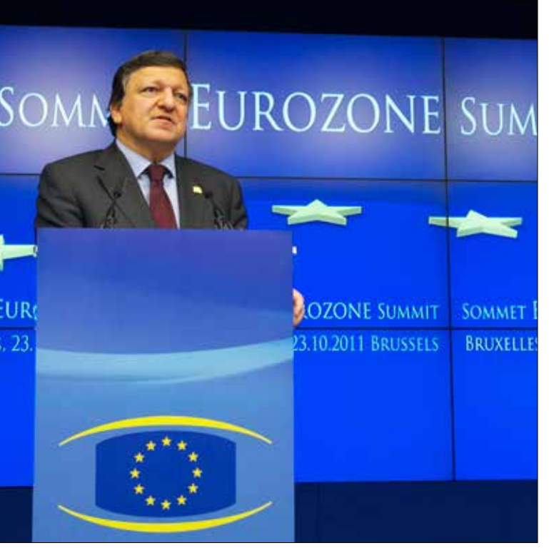
José Manuel Barroso, President of the European Commission, speaking at the EuroZone Summit in October 2011.

reverse has happened. In the 1990s, poor people around the U.S. were offered 100 percent loans to buy houses at low rates with virtually no collateral.